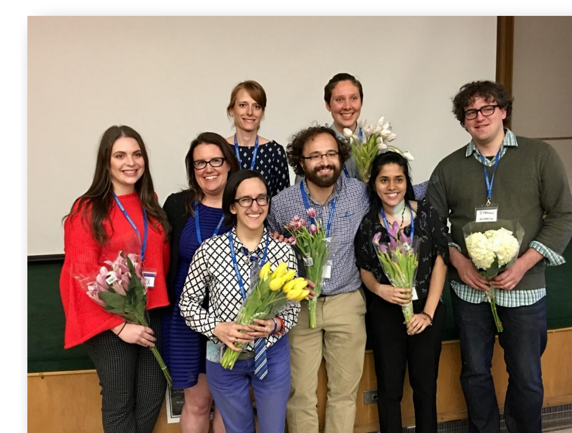
Picture of conference committee