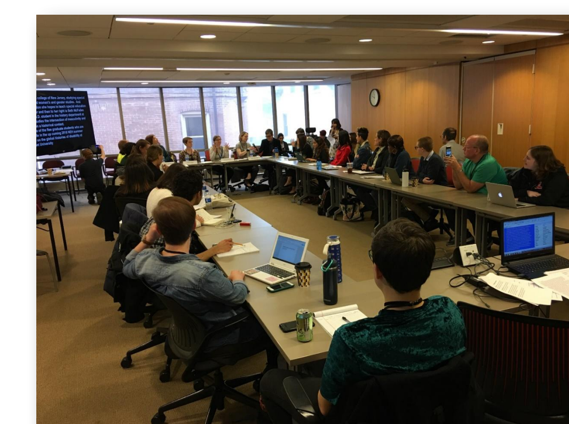
Picture of panel discussion.

Accessible, collegial, supportive, friendly, high-energy, and stimulating!